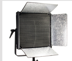
IDMX1000-v2 Studio Light w/ Touchscreen