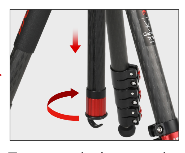
Turn anti-clockwise and pull downwards to remove centre pole. Spread legs required height.