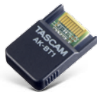
AK-BT1 Optional Bluetooth adapter for remote control via iOS/Android mobile devices

Select a recording app from the touchscreen and off you go!